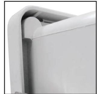
Ribbed Cover Corners