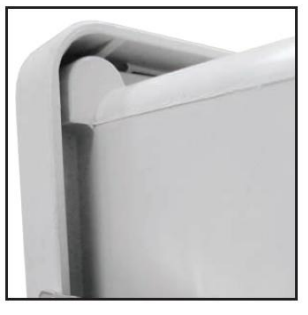
Ribbed Cover Corners