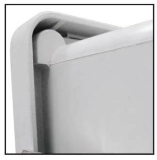
Ribbed Cover Corners