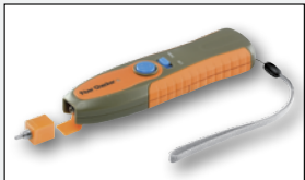
Light source fiber checker

When using the XP-FIT Field Termination Kit and the XPFIT field terminable LC or SC connectors, L-com recommends two additional accessories: A fiber launch cable and a fiber coupler. Having a launch cable will allow an installer to be sure each cable works by having a tested, known quantity cable readily available. A coupler will allow any newly created cable to be joined to the launch cable for testing purposes. The type of cable and coupler can vary based on your individual application as the mode of the cable and coupler must match for an accurate reading. The light source fiber checker included in the kit will work with any 2.5mm or 1.5mm connector including common connectors such as LC, SC, ST, and FC.