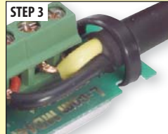
Secure cable with cable tie to connector.