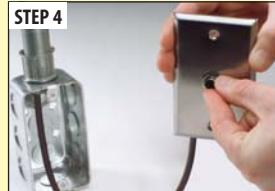
Attach to faceplate and install.