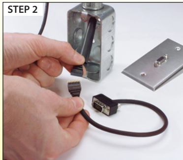
Slip shrinkable tubing onto cable, mate the breakout connector matching alignment arrows and secure.