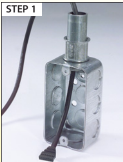
Feed socket end through conduit (3/4" min. dia.) into destination outlet.