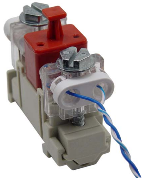
Suppression Module Detail