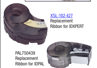
XSL-102-427 Replacement Ribbon for IDXPRT