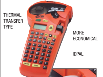
THERMAL TRANSFER TYPE