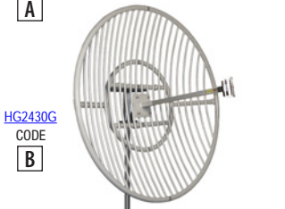
HG2430G CODE B