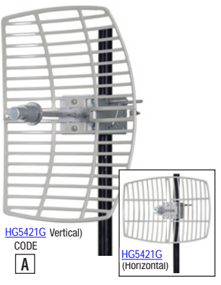
HG5421G (Vertical) CODE A