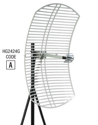
HG2424G CODE A