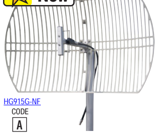
HG915G-NF CODE A