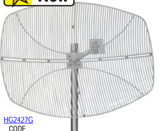
HG2427G CODE A