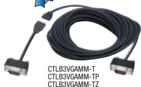
CTLB3VGAMM-T CTLB3VGAMM-TP CTLB3VGAMM-TZ