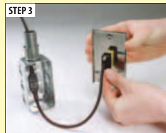
STEP 3 Attach pre-terminated HD15 connector to faceplate and attach to outlet.