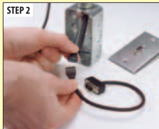
STEP 2 Slip shrinkable tubing onto cable, mate the breakout connector matching alignment arrows and secure.