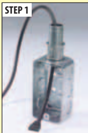
STEP 1 Feed socket end through conduit (3/4" min. dia.) into destination outlet.