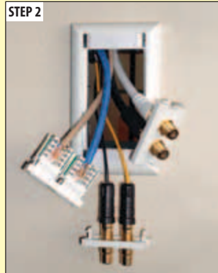
2. Attach cables to each module. At this time, it's best to test cable connections for continuity.