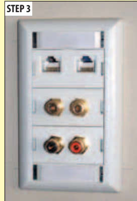
3. Insert completed modules into wall plate and snap firmly into place.