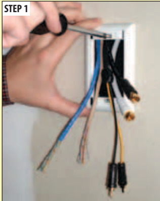
1. Pull all cables through the wall plate and attach the plate to the wall box or bracket.