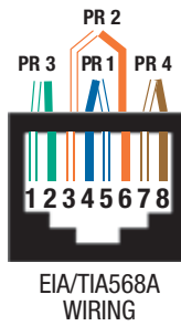
RJ45 Jack (8x8)

There are two common wiring standards for LAN wiring. When buying components such as jacks or patch panels, be sure to specify if you need EIA568A or EIA568B.