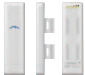
UB-NS2 Front View UB-NS2 Side View UB-NS2 Back View