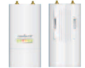
UB-ROCKETM5 Front View UB-ROCKETM5 Back View