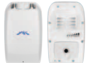
UB-PS2-EXT Front View UB-PS2-EXT Back View