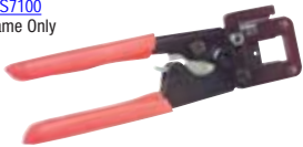
HTS7100 Frame Only