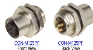
CON-M125PF Front View