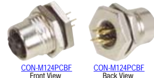
CON-M124PCBF Front View