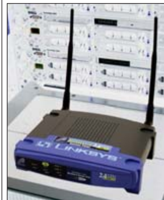
HG2405RD-RTP Shown on a Linksys® WAP54G wireless access point