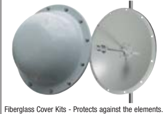
Fiberglass Cover Kits - Protects against the elements.