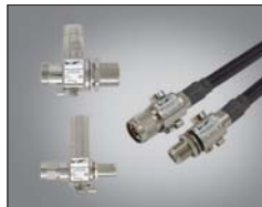
Coax Lightning Protectors