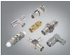
Adapters, Couplers and Splitters