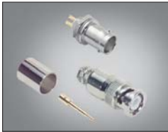
BNC & Twin BNC