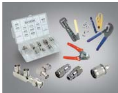
Installation Tool and Adapter Kits